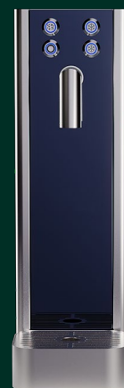
BLU GLASS TOWER ONE Under-counter combi