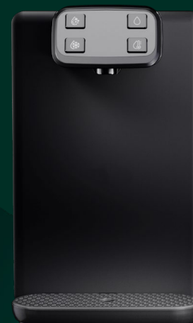
BLU REBEL Counter-top