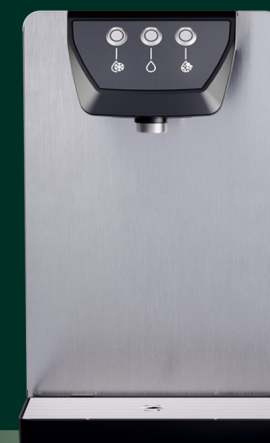
BLU ROCK Premium counter-top